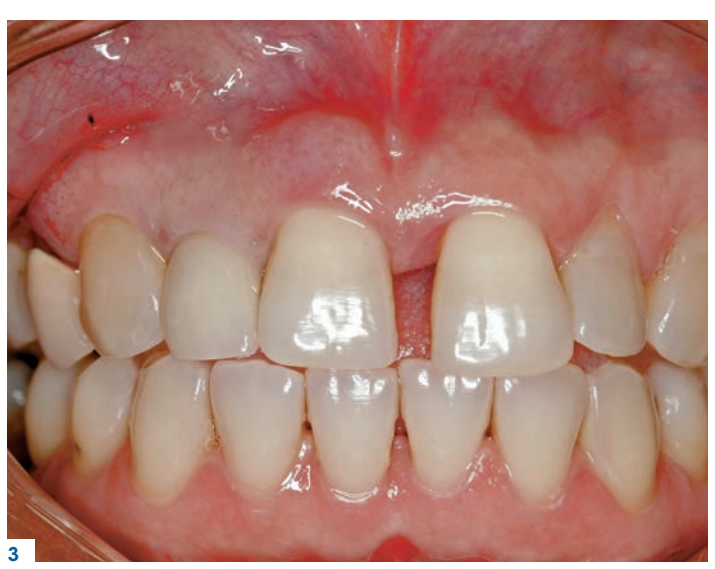
[ Figs. 1-3 ] Patient's teeth on the day of periodontal surgery (Fig. 1). Patient's teeth three months after surgery and the day the Perio Tray was delivered (Fig. 2). Patient's teeth after six weeks of Perio Tray usage (Fig. 3).

Perio Protect is the one treatment that I have utilized in the last two years that works. After any comprehensive periodontal examination, part of my recommended treatment protocol includes Perio Protect. The Perio Tray® delivers a 1.7% hydrogen peroxide gel deep into periodontal pockets to reduce inflammation and infection. Patients use the trays in 10- to 15-minute increments as part of their home care.